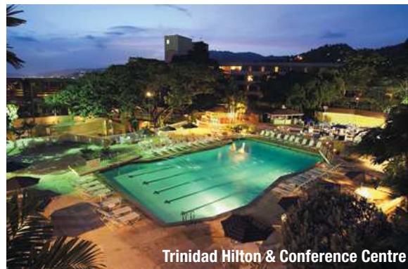
Trinidad Hilton & Conference Centre